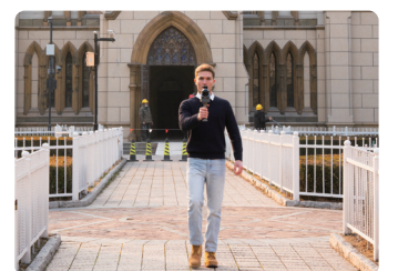
Cultural Tourism and Heritage Preservation