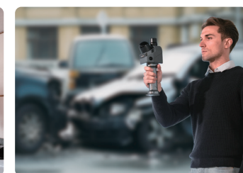
Public Safety and Forensic Investigation