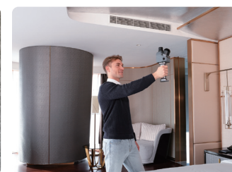
Interior Design and Renovation